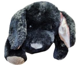
Beacon's Magic World of Vision Third Grade Educational Program