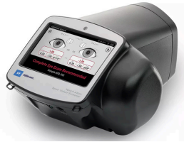
Spot Vision Screener