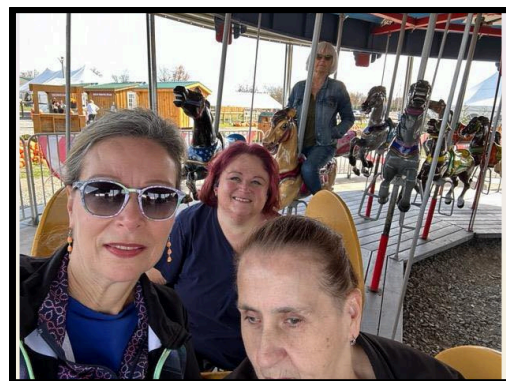
Lakeland Orchard outing

Seasonal parties and outings: summer picnic, fall outing, Winter Wonderland party. Our monthly calendar of events is available in email, audio, print and braille formats to keep our clients abreast of the latest agency happenings.